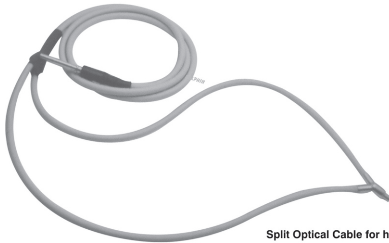
Split Optical Cable for head Light