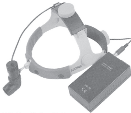
LED Headlight with Battery 3W / 5W CO 23