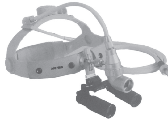
Headlight with Loupes 2.5x 3x 3.5x 4x 5x 6x CO 22