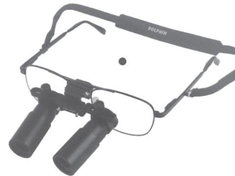
Galilean Loupes 2.0x CO 20