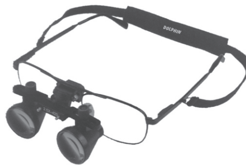
Keplerian Prism Loupes 3x 3.5x 4x 5x 6 CO21