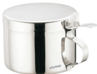
Spitting Mug with Lid