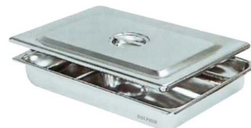
Surgical Tray with Cover: 3993-1982