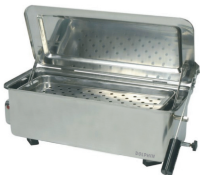
Sterilizer S.S. Seamless Table: 5022-1989