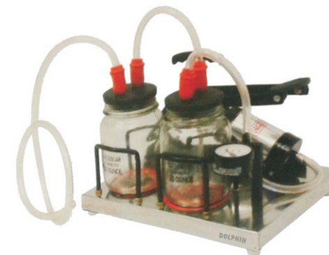
Foot Suction Apparatus