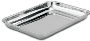
Baby Tray without Cover