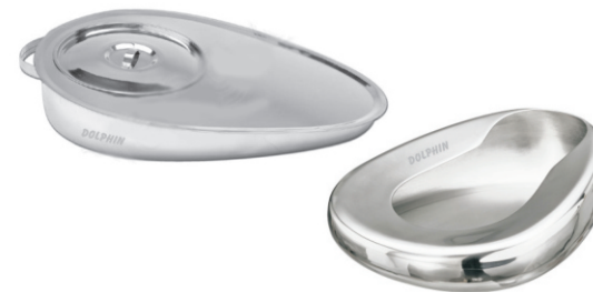
Bed Pan Stainless Steel