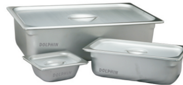
Cidex Tray with Cover