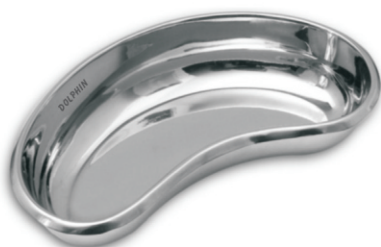
Kidney Tray: 3992-1982 (Heavy Quality)