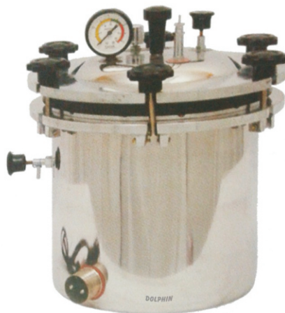
Autoclave Six wing Nut SS