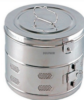
Dressing Drum S. S. Seamless: 3831-1979