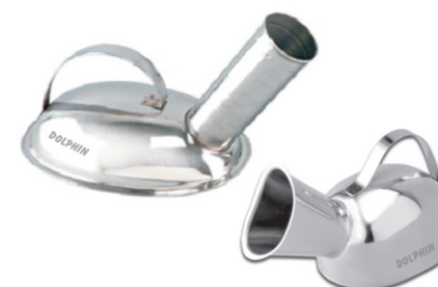
Urinal Stainless Steel (Cap. 700ml)