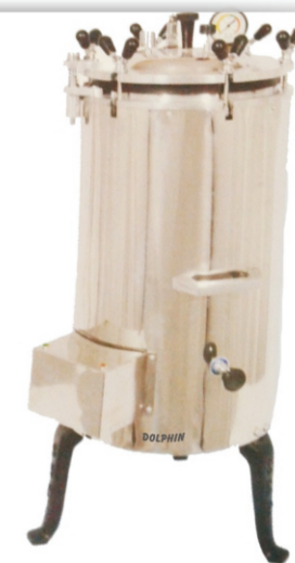
Vertical Autoclave Wing Nut SS