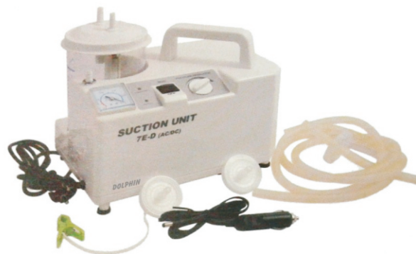
Ambulance Suction Machine